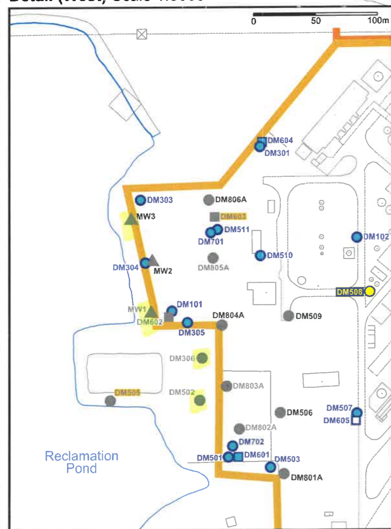
Detail (West) Scale 1:3000

LOCATIONS SHOWN ARE APPROXIMATE AND ARE TO BE USED FOR INDICATIVE PURPOSES ONLY